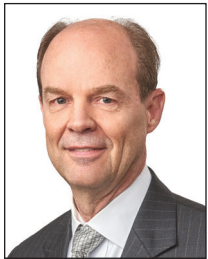
Donald L. Swanson

Judge-shopping is frowned upon. And when it happens, it’s generally considered an abuse of the legal system. The Judicial Conference of the United States is making a new effort to deter judge-shopping by proposing the random assignment of cases among judges within each federal district court. The proposal is based on policies of (1) ensuring that district judges remain generalists, and (2) ignoring perceptions of relative merits or abilities of the various judges. Such a proposal does not apply to bankruptcy courts. And I hope and predict that the proposal will not spread to bankruptcy courts. Here are two reasons why.